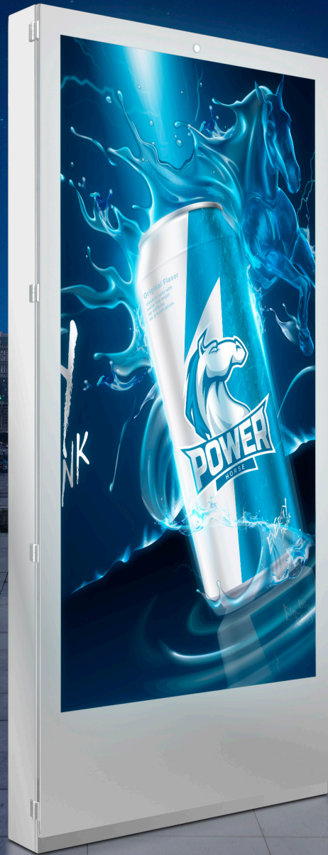
CLARO Direct Screen